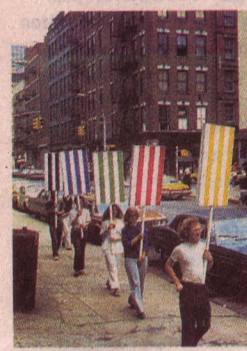
● Daniel Buren Oxford

One of the most influential artists in France, Buren remains underappreciated over here, maybe due to his Gallic combination of visual grace with a deeply questioning intellectual rigour. Buren achieved an epiphany in the mid-60s, when he discovered a quantity of striped awning in a Montmartre textile market. From then on the cloth became his trademark material in site-specific, urban interventions, as he hung his stripes around the metro stations of Paris and blocked a gallery